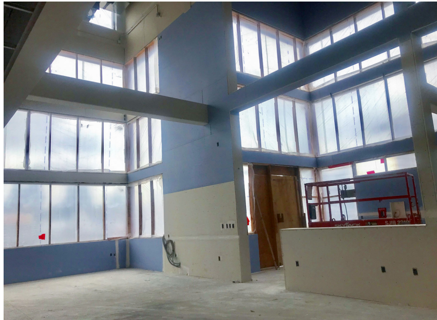
Administration area and front entrance